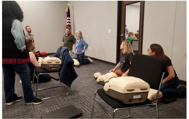
NRC Staff participated in basic first aid and CPR training presented by the Cass County Health Department.