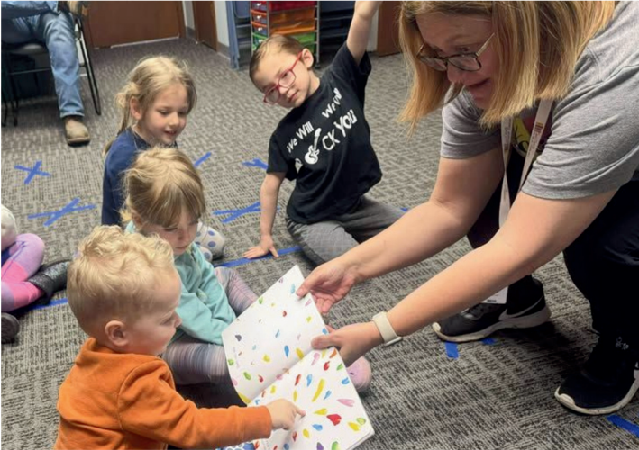
Storytime at Garden City