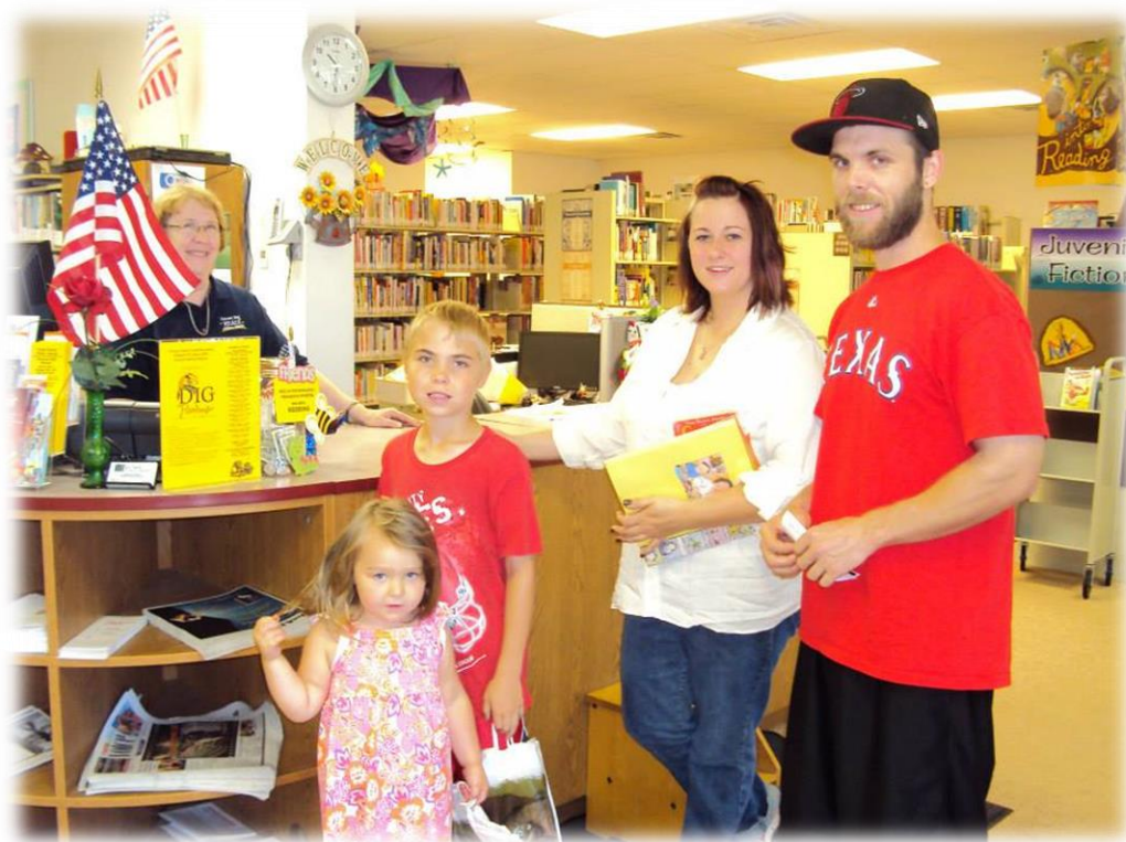
Checking out books at the Pleasant Hill Branch.

Our mission is to provide informational, educational, and enrichment services and resources to the community through a comprehensive and efficient library system.